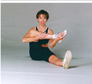
Fig. 4 Knee to Chest - Seated

1 2 3 4 5 6 7 8 9 10 11 12 13 14 15 16 17 18 19 20 21 22 23 24 25 26 27 28 29 30 31